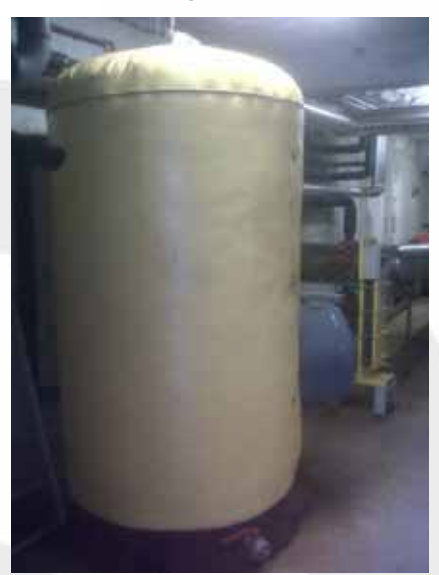
Storage tank for hot water