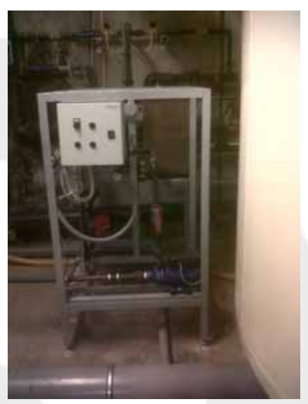
Exchanger system with pump and control