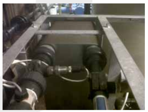
Plate heat exchanger