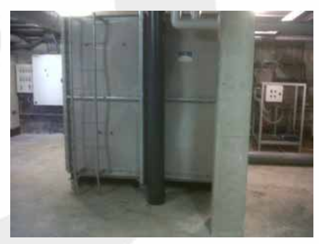
Buffer tank for reclaimed water